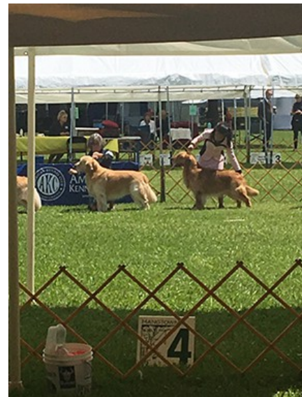
The view from the announcer's chair on Saturday.