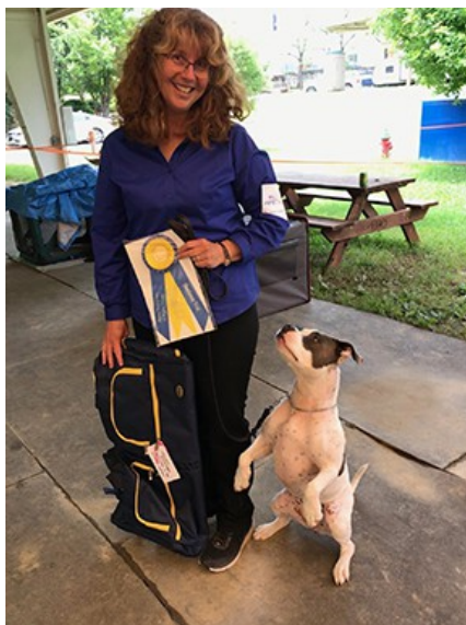
An "All American" rescue dog won HIT!