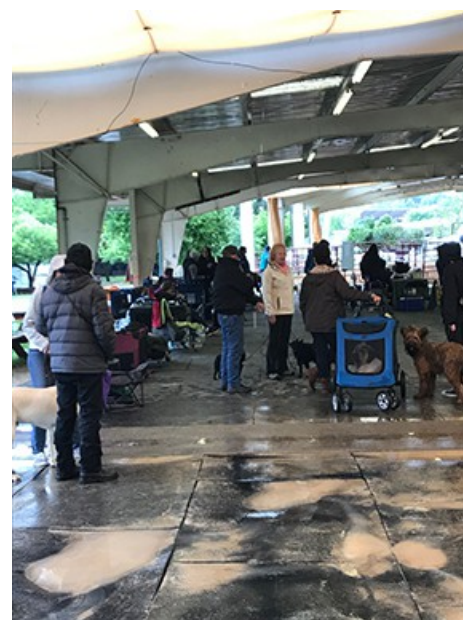
The view from the Obedience Ring on Sunday!

Well, the show was certainly a mix of good weather and bad weather but overall, it was a great weekend! Thanks to all the hardworking members and several non-members, we will live to fight another day!