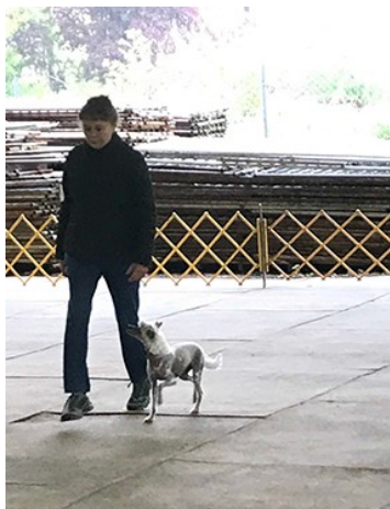
Who says performance dogs can't be exotic?